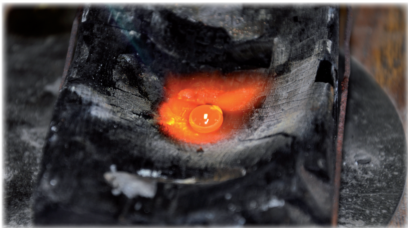
This drop of gold, heated at 1'064,18°C (1'948°F), will give birth to Cherry Trees, Koi Fish, flying birds and other mystic Water Dragons.