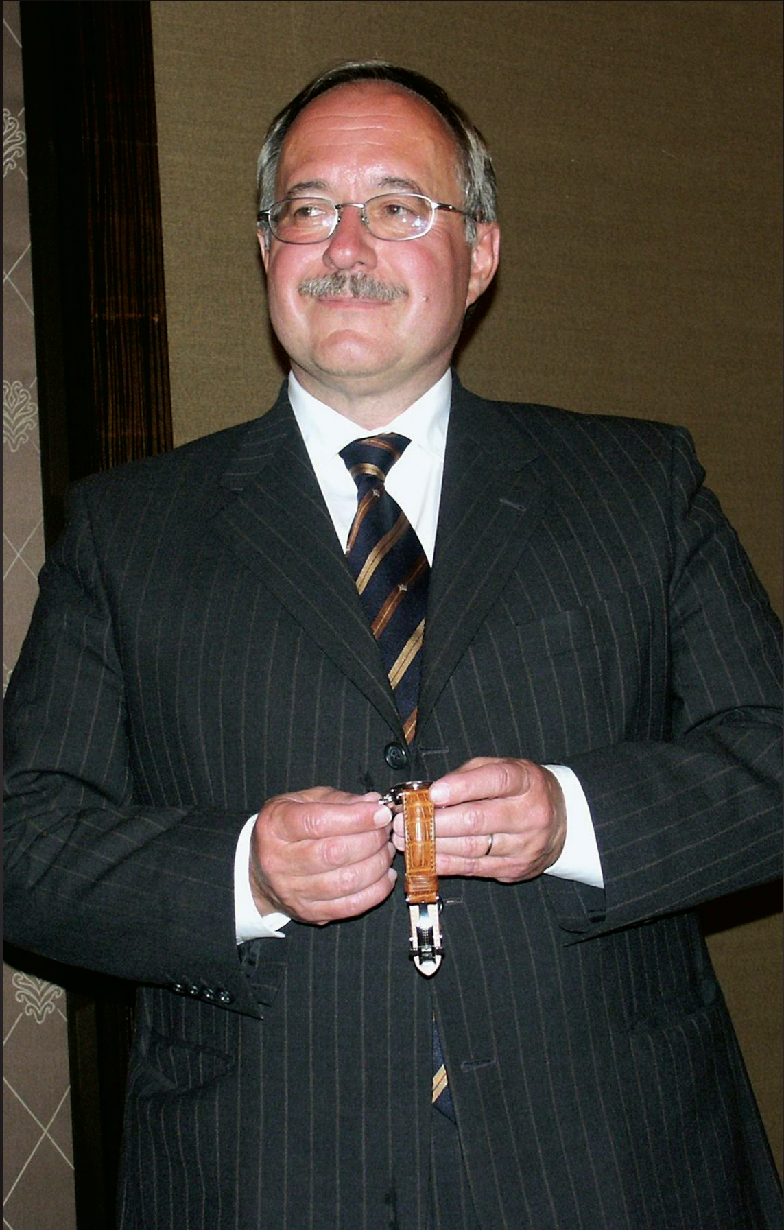
Samuel Schmid, President of Switzerland in 2005