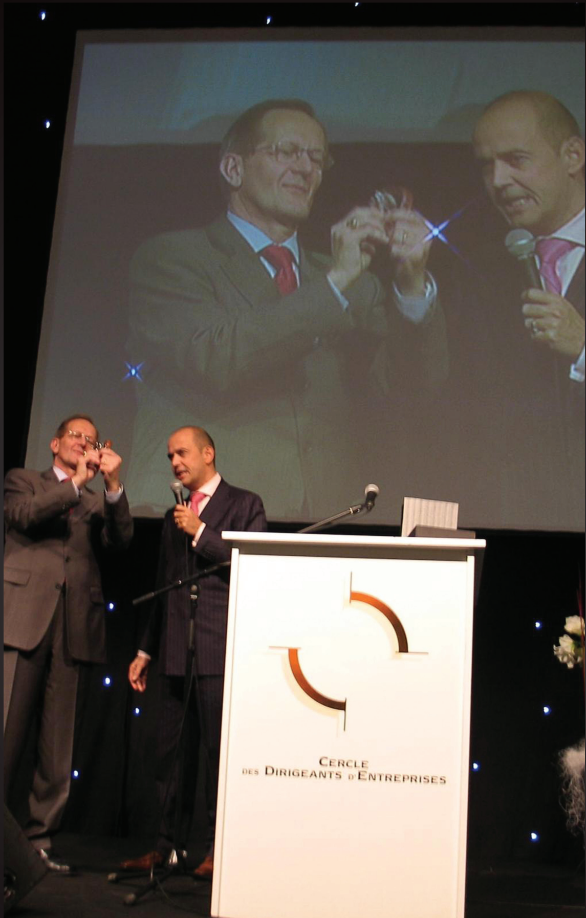
Joseph Deiss, President of the United Nations and President of Switzerland in 2004