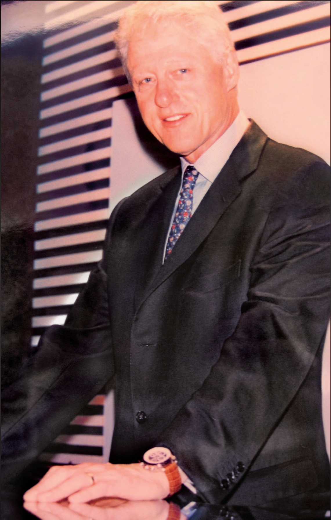
Bill Clinton, President of the USA from 1993 to 2001