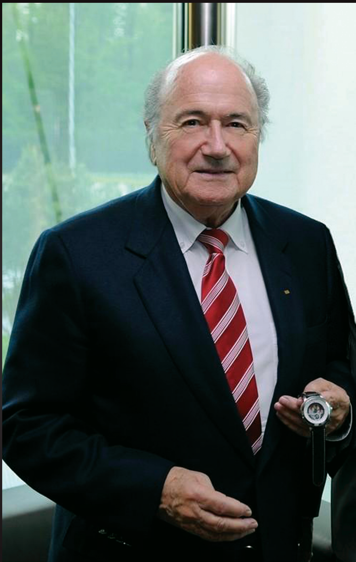
Sepp Blatter, President of FIFA