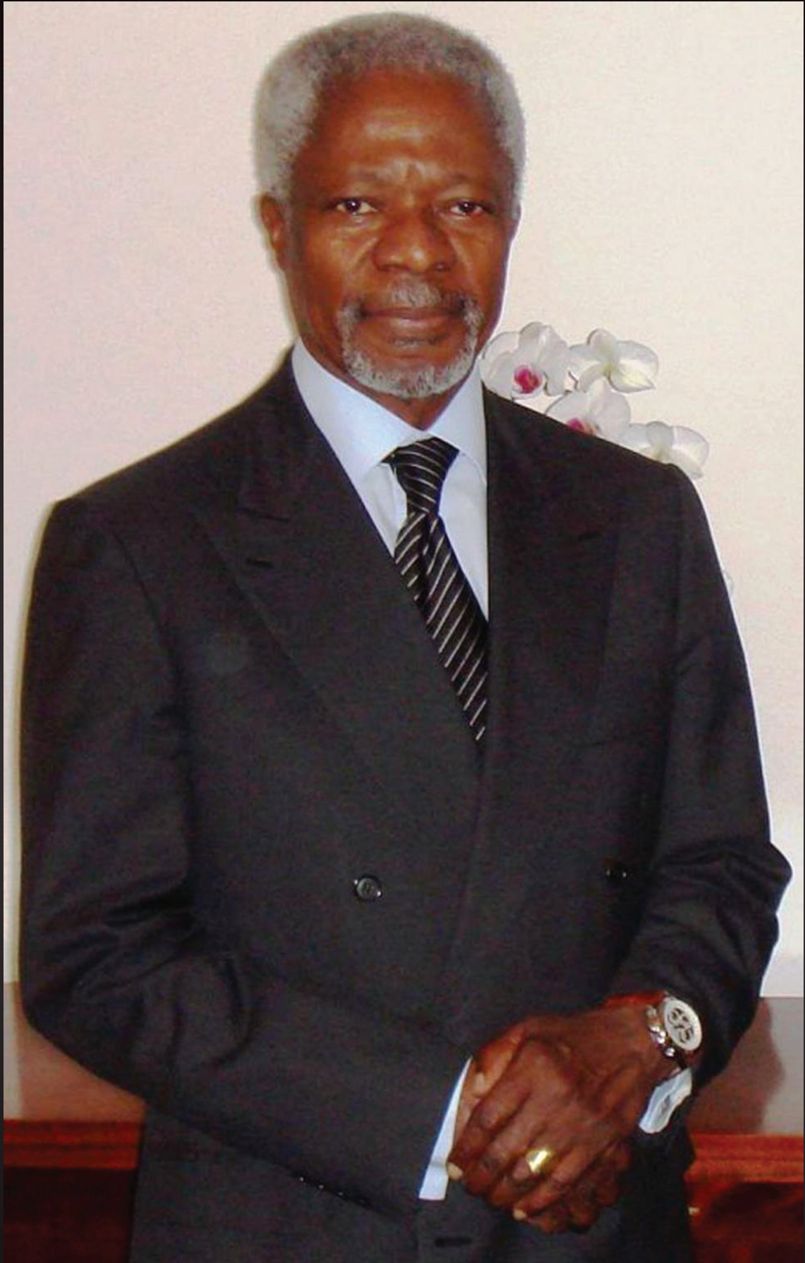
Kofi Annan, 7 th Secretary General of the United Nations