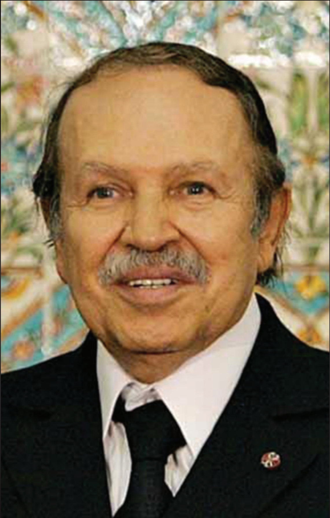
Abdelaziz Bouteflika, Prime minister of Bahrain