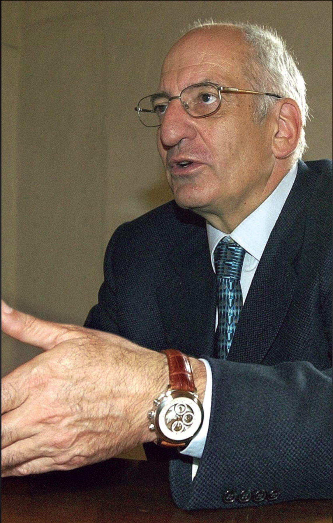
Pascal Couchepin, President of Switzerland in 2008 and 2003