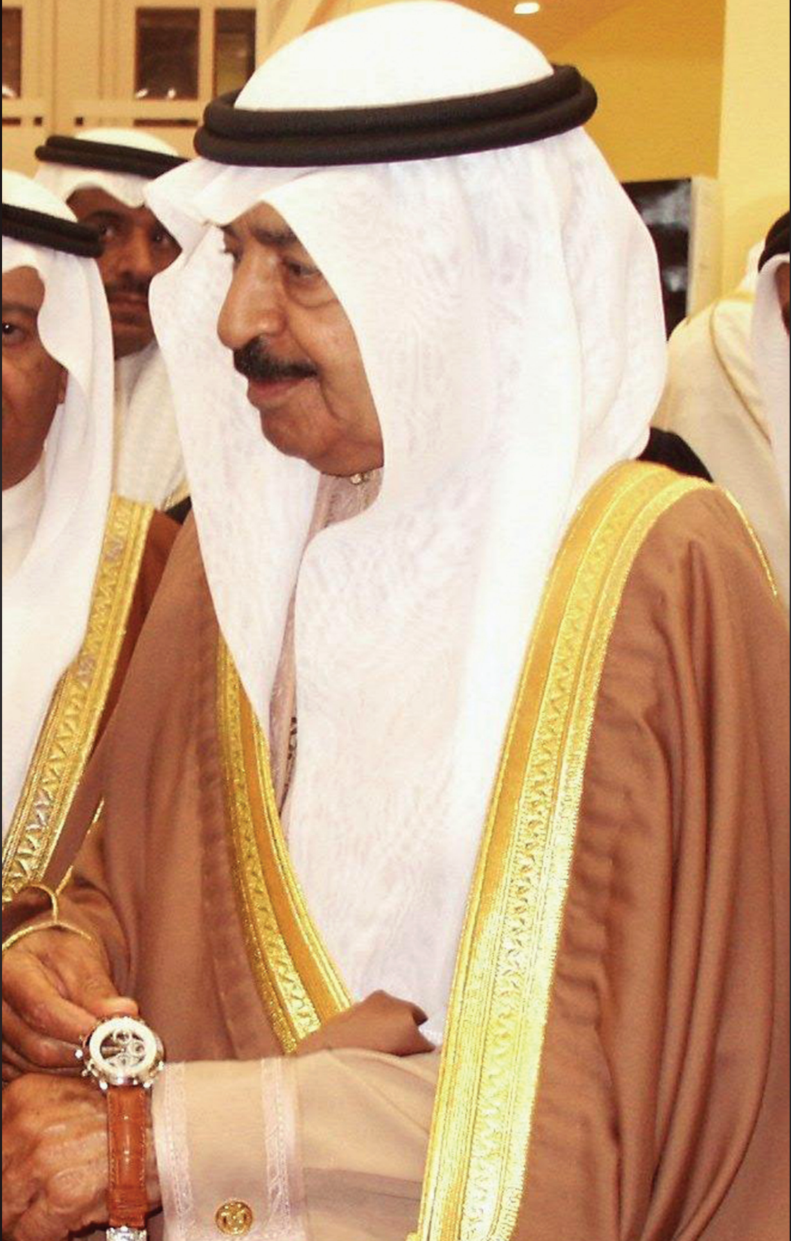
Sheikh Khalifa bin Salman al Khalifa, Prime minister of Bahrain