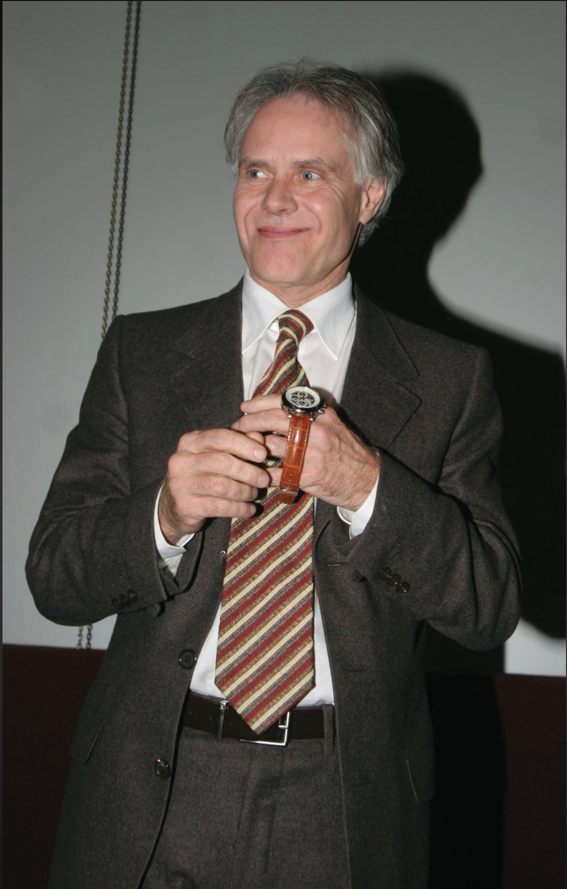
Moritz Leuenberger, President of Switzerland in 2006